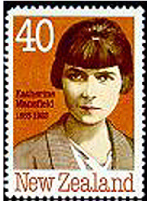
New Zealand issued this postage stamp in honour of Katherine Mansfield.

Mount Roskill Grammar School in Auckland, Rangiora High School in North Canterbury, Westlake Girls High School in Auckland, Macleans College in Auckland, and Wellington Girls' College in Wellington have a house named after her.