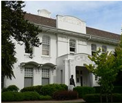
The Melba Memorial Conservatorium of Music, Melbourne

Melba, associated herself closely with the Melbourne Conservatorium, which had recently broken away from control by the University of Melbourne. She taught there from 1915 until her death in 1931. A link with her continued after her death through her provision of a generous bequest and it is her association with the Conservatorium which was responsible for the change of name of the institution, in 1956, to the Melba Memorial Conservatorium of Music.