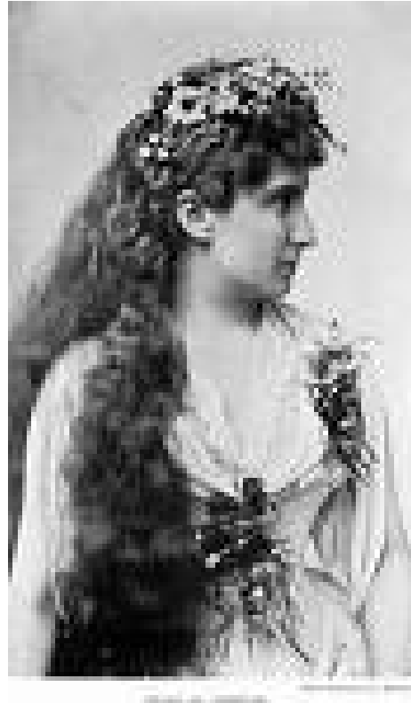
Melba as Ophelia

Melba was fortunate in that the greater part of her career coincided with Covent Garden's golden age, even though its architect, the impresario (Sir) Augustus Harris, had initially engaged her reluctantly. Harris mounted spectacular productions involving hundreds, broadened the repertoire and widened the audience while still drawing the aristocracy. Melba found the Royal Opera's extraordinary social status exhilarating. Even though some of her greatest triumphs occurred elsewhere, most notably at La Scala in 1893 and repeatedly in New York, it was to Covent Garden that Melba returned season after season, maintaining a permanent dressing room to which she alone held the key. There she reigned supreme.