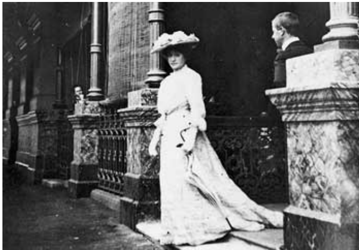
Dame Nellie Melba outside Brisbane's Gresham Hotel, circa 1909.