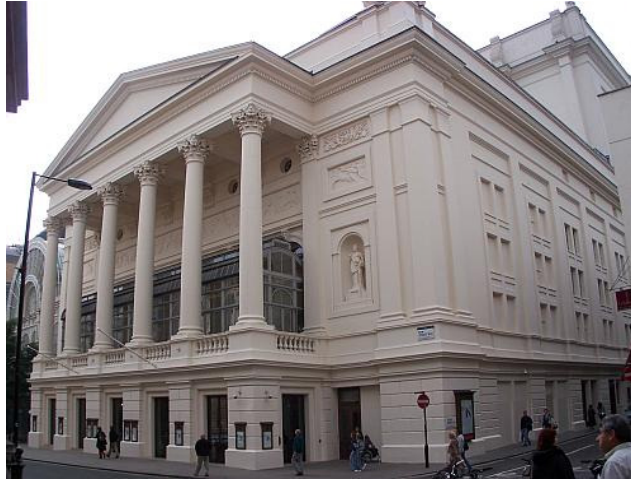
Royal Opera House - Covent Garden

Assisted materially by her friend Lady de Grey, Melba moved freely in high society. It was remarked that she carried herself as if to the manner born. On first-name terms with the great, she would sing at their houses only when it pleased her: a not unreasonable attitude when, in addition to her tours to Continental opera houses, she had been invited to sing in St Petersburg before Tsar Alexander III, had sung in Stockholm before King Oscar II, in Vienna before Emperor Franz Joseph and in Berlin before Kaiser Wilhelm II. She had also been commanded by Queen Victoria to Windsor. "Years of almost monotonous brilliance" was the summation on her Covent Garden farewell programme. When she appeared in distant places, she was mobbed, much as pop-singers are today.