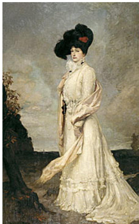
Madam Melba: 1902: Rupert Bunny: National Gallery of Victoria