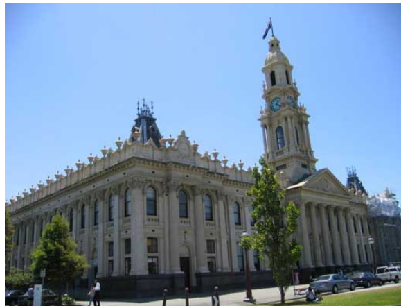
Melbourne Town Hall

time accompanist, manager and opera company impresario, and who would be present at her deathbed.